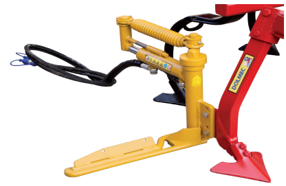
anchors for weed removers