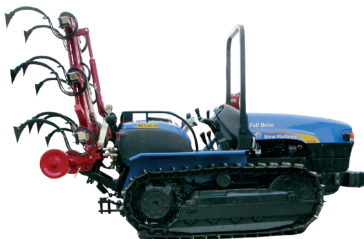
Hydraulic vertical overturning 90°